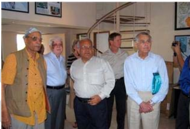
[At The Himalayan Club Centre]

Sunday, 17 th February 2008 was the 80 th birthday of The Himalayan Club. We celebrated the occasion with our guests, indulging in the historic photos along with the scrumptious Jalebis at the HCC.