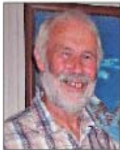
Sir Chris Bonington