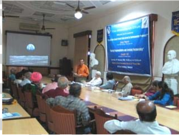
[Environmental Seminar at IMC]