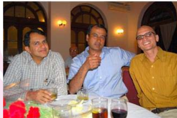
[Sharing the good moments]

There was quite a solicitous inclusion of mind blowing slide illustrated lectures on history, environment and of course climbing. And we had great personalities to deliver these lecture and a grand audience to appreciate the Celebration. As it should be at every such gathering, the mingling of young members with the legendary personalities of Club was of prime essence. And thus ended the birthday party – guests satisfied with climbing, trekking, cruising, lectures, discussions and as always, good food - the mainstay of all celebrations!